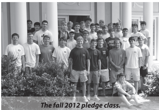
The fall 2012 pledge class.

Gamma has a lot to be excited about, including the new initiates into the Order. I had the pleasure of rushing all of these fine young men, and I can say that they are a bright group of true gentlemen. At the house, the Mothers’ Club has so kindly given us the go ahead to start on a fireplace and grill area – a project that has been under consideration for some time. These additions will no doubt bring pledge classes closer and help unite the fraternity even more.