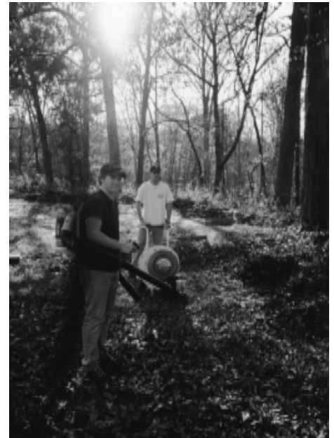
Undergrads cleaned up the Oconee Hill Cemetery as part of KA Clean-Up.

Thanks to your contributions, Between the Columns is published for the members and friends of the Kappa Alpha Order at the University of Georgia. Address changes, news items, photographs and contributions are always welcome and may be mailed in the enclosed envelope or sent to Kappa Alpha Order, Alumni Records Office, P.O. Box 161188, Atlanta, GA 30321-1188.